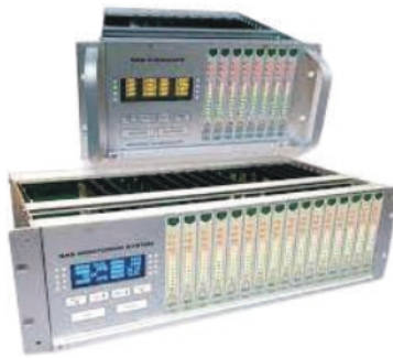
Gas Monitoring Panel Make : Honeywell (Digi Guard)