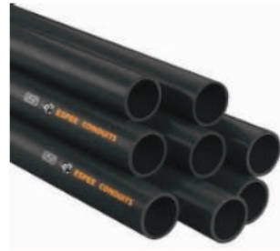
Conduit & Saddle