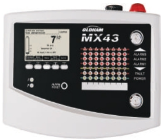
Gas Monitoring Panel Make : OLDHAM