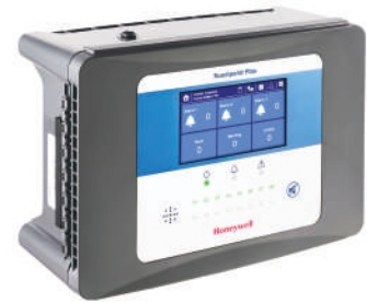
Gas Monitoring Panel Make : Honeywell (Touch Point)