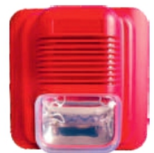
Alarm Hooter with Flasher