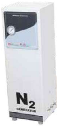
Model: NGLC 35 (Wall mounted Nitrogen for LCMS)