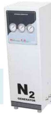
Model: NAGLCS (Wall mounted Generator for Sciex LCMS)