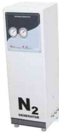
Model: NAGLCSP (Wall mounted Generator for Perkin Elmer Q-Sight/Shimadzu)